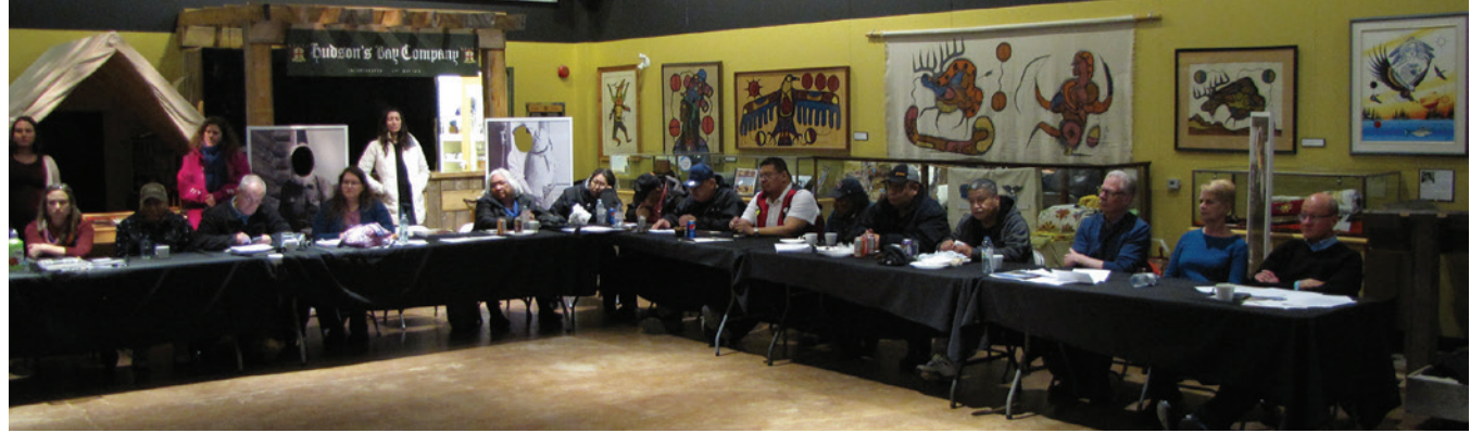
Pimachiowin Aki Corporation 2018 Annual General Meeting, Red Lake, Ontario